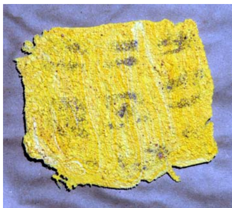
Figure 1. Polyvinylsiloxane cast of LCV treated shoe print from concrete.

Dental stone, Mikrosil and Polyvinylsiloxane yielded very poor results. All three materials failed to transfer any untreated bloody impression to the casting material on all surfaces tested. Dental stone and Mikrosil failed to transfer LCV treated bloody impressions on all surfaces tested as well. Polyvinylsiloxane did transfer some LCV treated bloody impression from concrete, but the quality was very poor (Figure 1). On the other hand, Alginate yielded very good results with both untreated and treated (LCV) impressions on all surfaces tested (Figures 2-4).