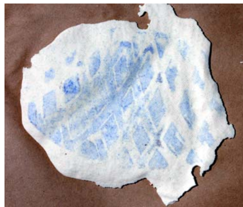
Figure 2. Alginate cast of LCV treated shoe print from denim.