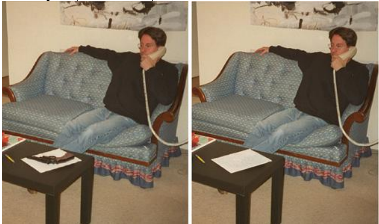
Figure 1. Left is original image. Image on right has been altered to remove weapon from table.

Common manipulation techniques amenable to analysis involve primarily alteration and compositing. Alteration is the changing of image features through the use of artistic means. Figure 1 provides an example.