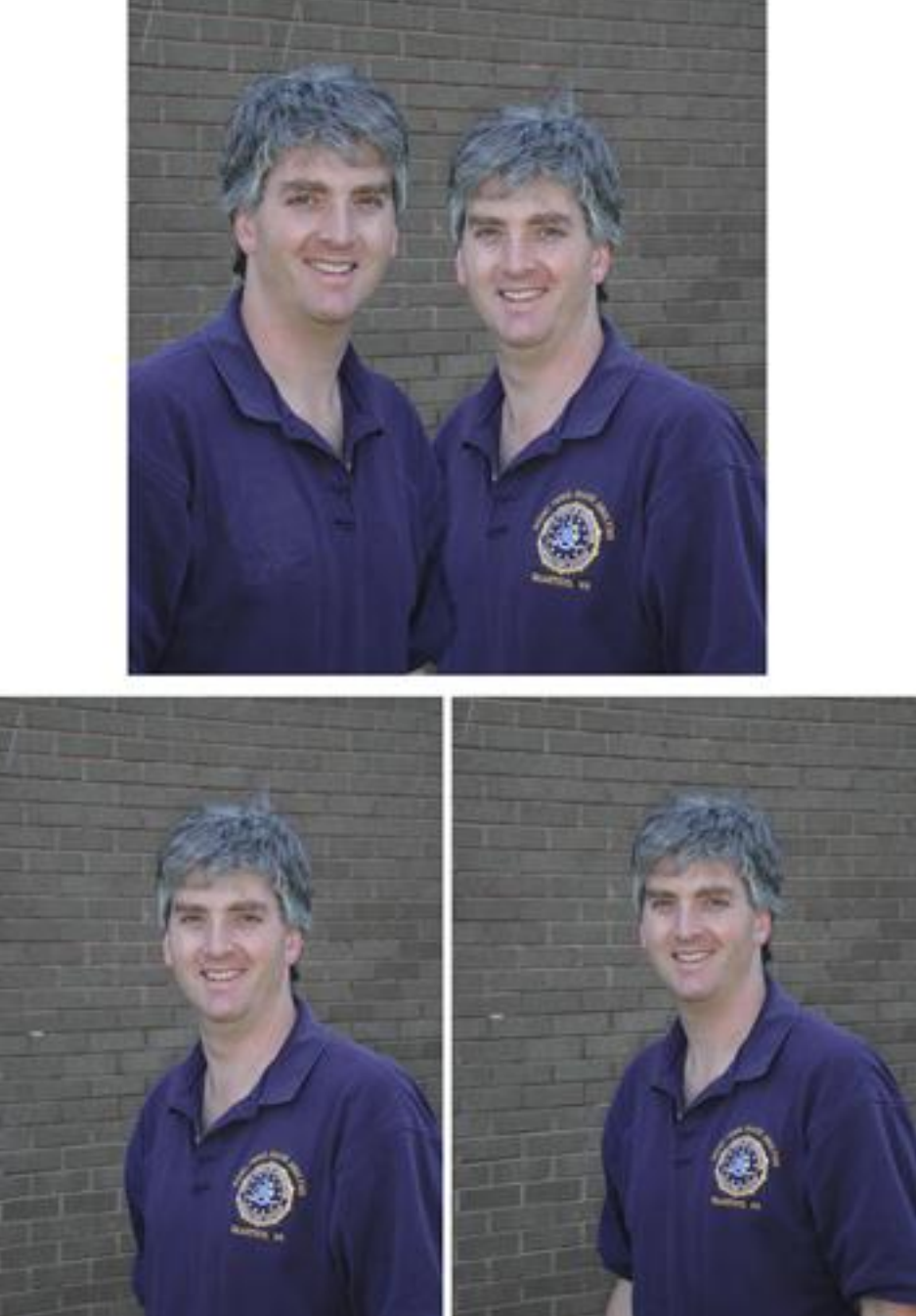
Figure 2. Top image has been created by altering bottom left image and compositing it with the bottom right image.

While it is technically feasible to manipulate an image, particularly a single still image, in a manner that is not detectable by subsequent analysis using currently available tools and techniques, such manipulations involve a number of practical issues. These issues include, but are not limited to: